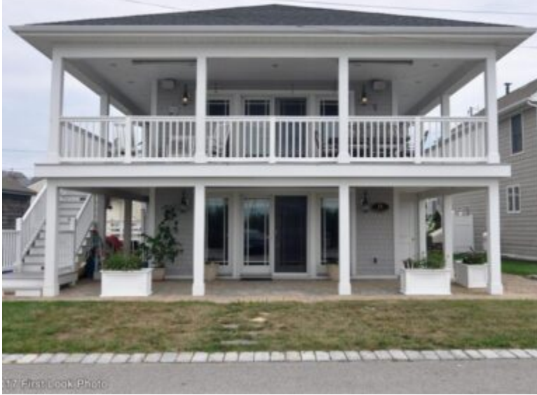
17 First Look Photo